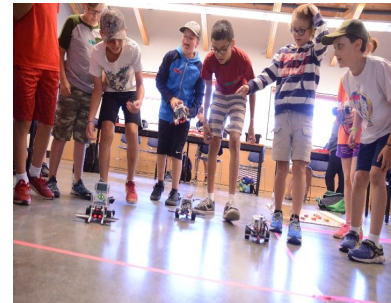
Registration is open for NICBotCamps, including a new Level 2 camp for kids

For more information on the camps, including videos with past participants, visit www.nic.bc.ca/robots .